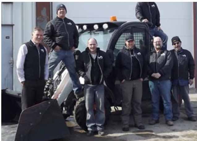
Here is the SDML facilities team!

Feedback from the participants and their chaparones was overwhelmingly positive. Plans are already underway for next year's event.